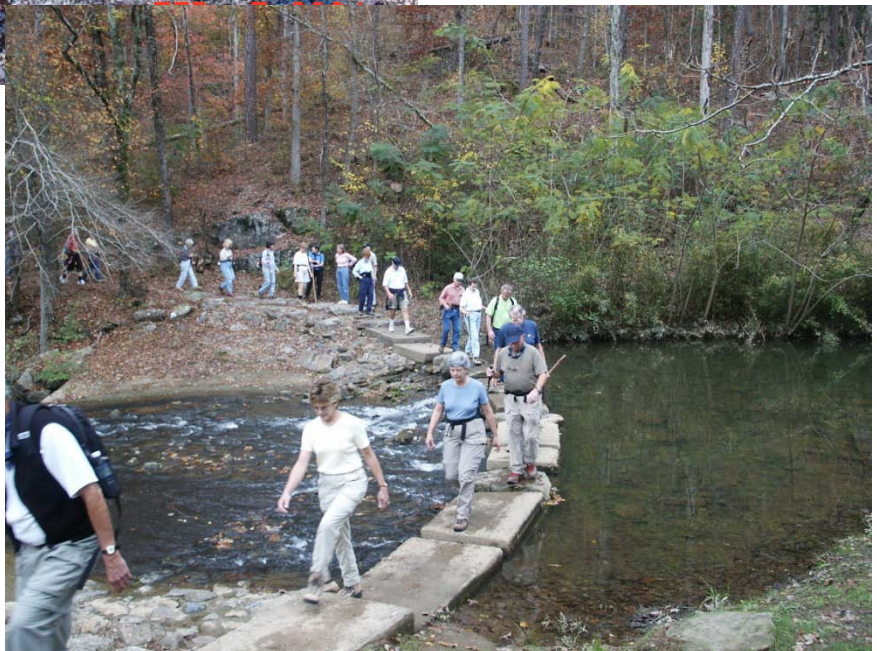
Creek crossing at Gupha Gorge Trailhead